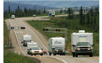
c- A recreational vehicle on American roads.