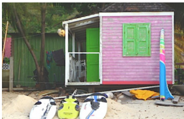
e- A beach house on Barbados, in the Caribbean