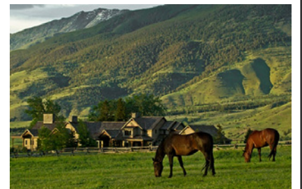
f- A ranch in Montana, USA